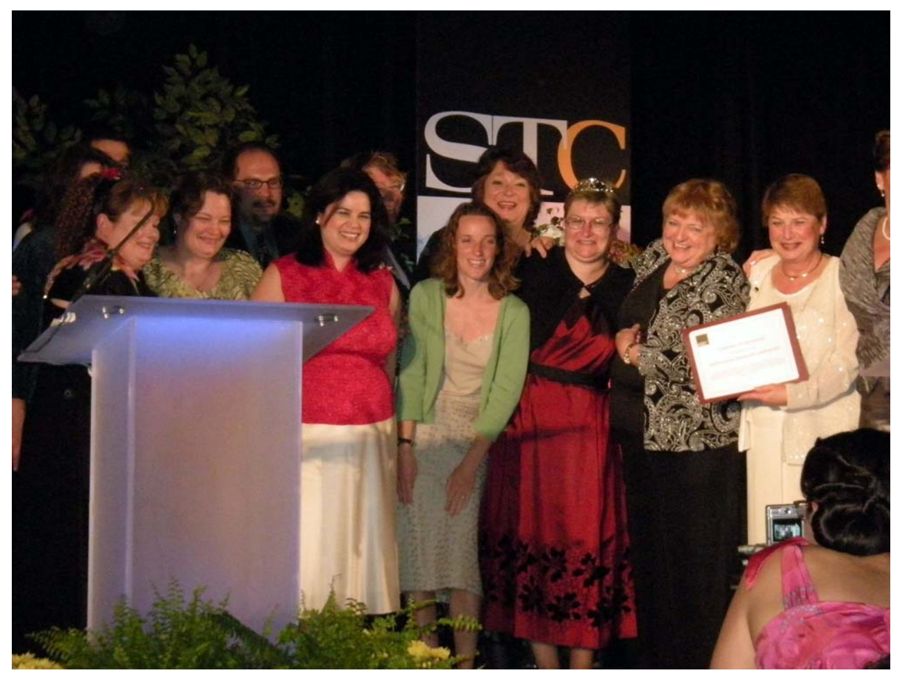
STC IDL SIG: A Community of Distiction!